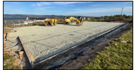
Above: Here is a view of our long-awaited MUGA under construction behind Gigha Hotel. Are you planning to make use of this new Gigha sport facility this summer?