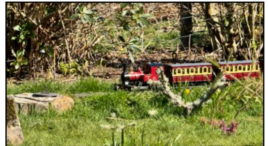
Above: Trains on Gigha! Well done to Nigel Braithwaite who recently raised £27 for Scotland's Charity Air Ambulance (SCAA) and £27 for The Sound of Gigha at the Drumallan Train Festival.